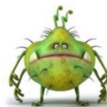
Ugh the Bug!

A good proverb to think about as we start the third week of Lent. Our theme of fasting provides us with many opportunities to think about, not only, what goes into our mouths but what comes from our mouths. Is our speech kind, gentle, uplifting, peaceful, nurturing, joyful? (all gifts of the spirit). Or do we need to fast from speech that is unkind, abusive, slanderous untrue or vulgar? By living in the present moment and thinking before we speak, we can be more aware of the message we are sending. In this weeks gospel Jesus speaks to us of "living water". Let what comes from our mouths be words that give life and lift up, not just for Lent but always.